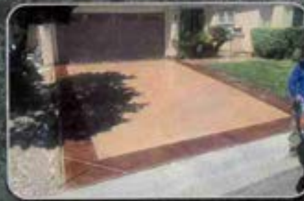
RESEALING | COATING