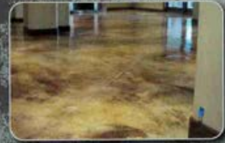
STAIN | SEAL INTERIOR

DISCLOSURE: DUE TO THE NATURE OF MATERIALS AND THE COATING PROCESS, SOME COLORS MAY NOT BE 100% ACCURATE. TO CONFIRM YOUR COLOR CHOICES, PLEASE OBTAIN SAMPLES. LICENSE # 0088063